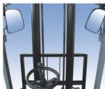
Wide view mast for clear front operator visibility