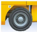
Minimum rear overhang for less turning radius