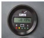
Elegant Instrument Panel with on board diagnostics