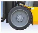
Large front tyres for enhanced road grip and stability