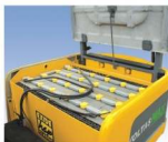
48V battery & AC traction for longer hours of operation