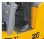
Wider Operator foot rest for safer entry and exit