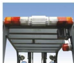
High Mounted Rear Combination and Beacon Lights